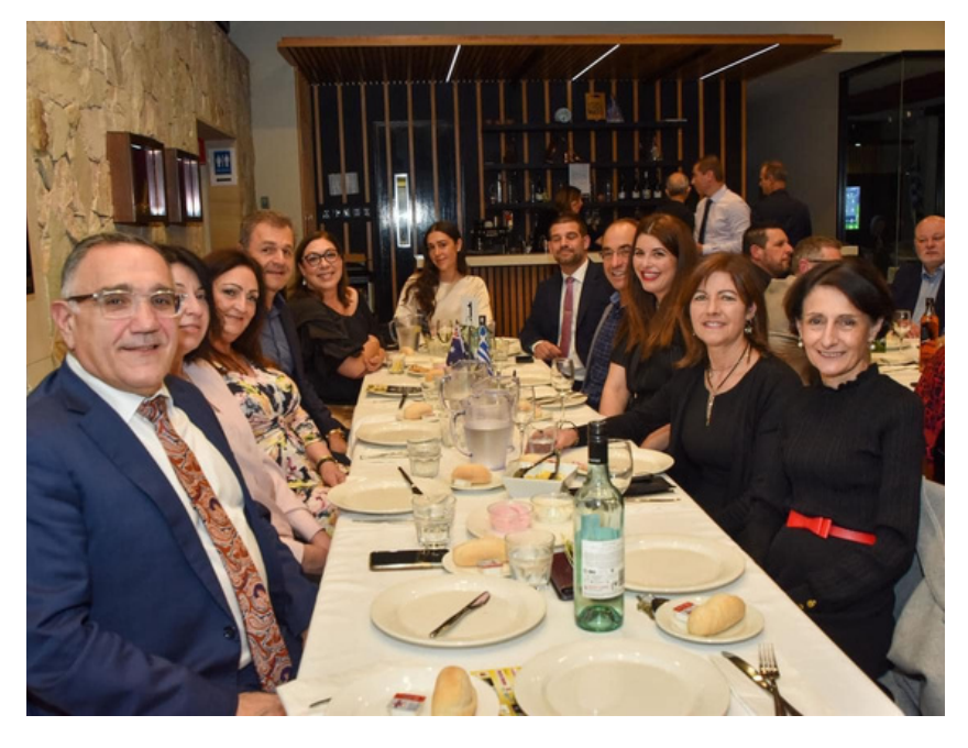
MEMBERS OF THE GOCSA ADMINISTRATIVE COUNCIL AT THE AUSTRALIAN HELLENIC MEDICAL CHARITY (AHMCI) ANNUAL FUNDRAISER.

On Friday, 2 June the Australian Hellenic Medical Charity Inc (AHMCI) held their annual fundraiser Gala Dinner for the purchase of an Anaesthetic Medical Unit and 15 medical beds for the Ikaria Hospital.